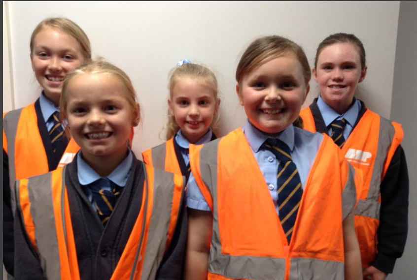
Health & Safety Leaders